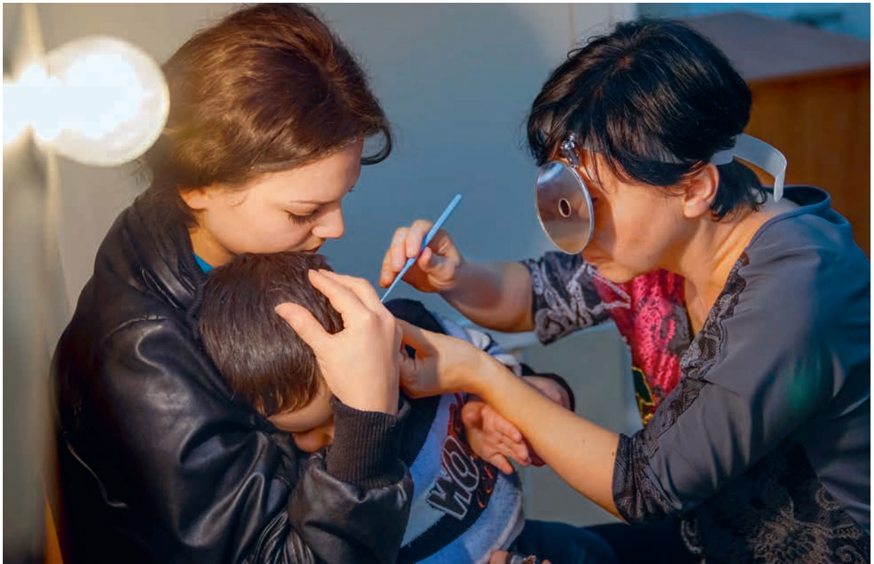
Before fitting a hearing aid, it is essential to clean the ear canal